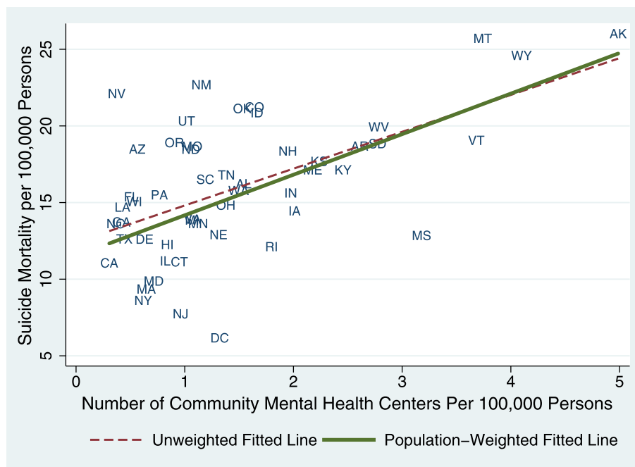
Fig. 2 Between-State Associations between Community Mental Health Center Availability and Suicide Deaths per 100,000 Persons. NOTES Data were from 2014 to 2017 National Mental Health Services Survey (N-MHSS) to identify state-level community mental health center status during 2014–2017 and from Centers for Disease Control and Prevention (CDC) Wide-Ranging Online Data for Epidemiologic Research (WONDER) data for suicide rates, identified as intentional self-harm by ICD-10-CM diagnosis codes U03, X60-X71, X72-X74, X75-X84, Y87.0. Each state’s coordinate represents its number of suicide deaths and community mental health centers per 100,000 persons in 2017. The unweighted fitted line was from unadjusted linear regression, giving each state equal weight, while population-weighted fitted line was from population-weighted linear regression, accounting for state population in 2017. A Community Mental Health Center included self-identified community mental health centers and partial hospitalization/day treatment facilities; a community mental health center was defined as a facility that provided any of the following services: 1) outpatient services, 2) 24-h emergency care services, 3) day treatment or other partial hospitalization services, or psychosocial rehabilitation services, and 4) screening for inpatient services to state mental health facilities, and that met applicable licensing or certification requirements for community mental health centers in a state where it is located [7]

SOURCE Data were from 2014 to 2017 National Mental Health Services Survey (N-MHSS) to identify state-level mental health facility status during 2014–2017 and from Centers for Disease Control and Prevention (CDC) Wide-Ranging Online Data for Epidemiologic Research (WONDER) data for suicide rates, identified as intentional self-harm by ICD-10-CM diagnosis codes U03, X60-X71, X72-X74, X75-X84, Y87.0. NOTE A Community Mental Health Center was defined as a facility that provided any of the following services: 1) outpatient services, 2) 24-h emergency care services, 3) day treatment or other partial hospitalization services, or psychosocial rehabilitation services, and 4) screening for inpatient services to state mental health facilities, and that met applicable licensing or certification requirements for community mental health centers in a state where it is located [7]. Mental health care facilities self-identified as a partial hospitalization or day treatment facility were also categorized as a community mental health center