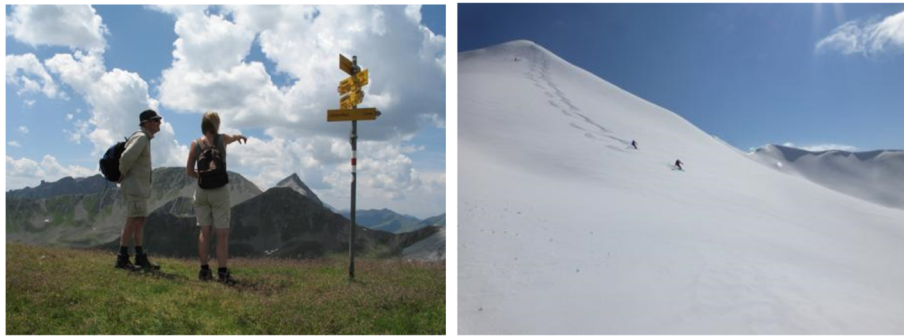
Fig. 3 Examples of alpine stimuli depicting individuals performing physical activity in an alpine environment. Neutral stimuli are not depicted since this is not considered good scientific practice for the IAPS picture collection [25]

Questionnaire [16]. Additionally, open text fields were provided for entering psychiatric diagnoses. Resilience was measured using the Brief Resilience Scale (BRS) [36], self-perceived stress using the Perceived Stress Scale (PSS) [7] and physical activity (PA) using the Global Physical Activity Questionnaire (GPAQ-2) [6]. PA is calculated using metabolic equivalents of tasks (METs) as a unit for energy expense. As proposed by the World Health Organization we classified PA in moderate and vigorous intensity. We adapted the standard questionnaire to measure PA performed in the alpine environment.