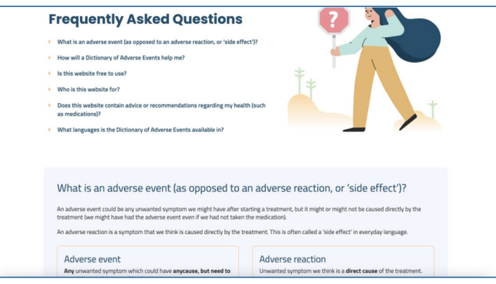
Fig. 3 a-d The Symptom Glossary website (https://thesymptomglossary.com)

(d) A 'Frequently Asked Questions' page. The first question addresses the difference between an 'adverse event' and 'adverse reaction'.