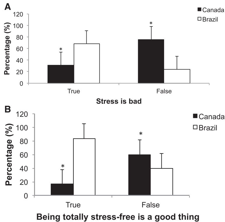
Fig. 1 Percentage of participants in Canada and Brazil indicating stress to be bad (a) and being totally stress-free is a good thing (b). * indicates p-values less than 0.01 between groups. The bars represent standard errors

the elements that represent the scientific psychological determinants of stress (novelty, unpredictability, low sense of control and social evaluation), as characteristics that induce a stress response. Figure 3.