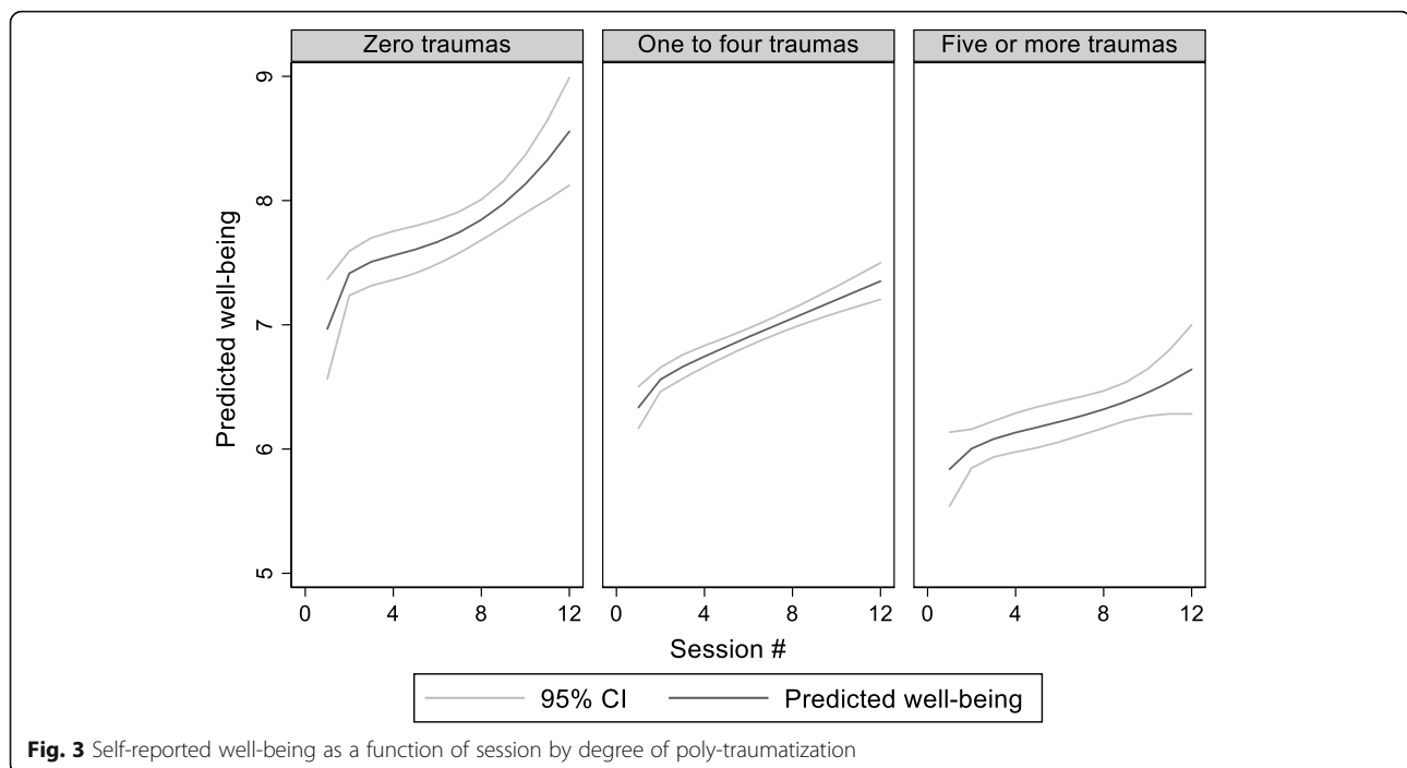
Fig. 3 Self-reported well-being as a function of session by degree of poly-traumatization

In this study, we found support for hypothesis-1 in that individuals who reported exposure to multiple types of trauma were less likely to reduce their use of cannabis in treatment and at a slower rate than individuals who reported fewer types or no types of trauma. In addition to this finding, our analyses also indicated that poly-traumatized youth enter DUD treatment with a higher use of cannabis than individuals with less types of trauma experiences.